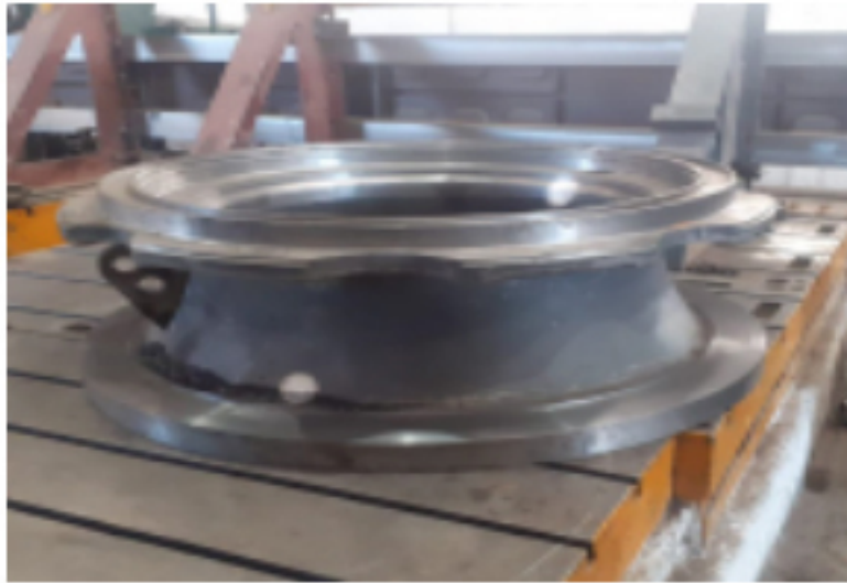
Ductile iron casting